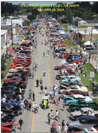
2019 Aerial Shot.